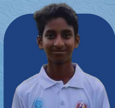
Naitik Sadaramka U-14 Category